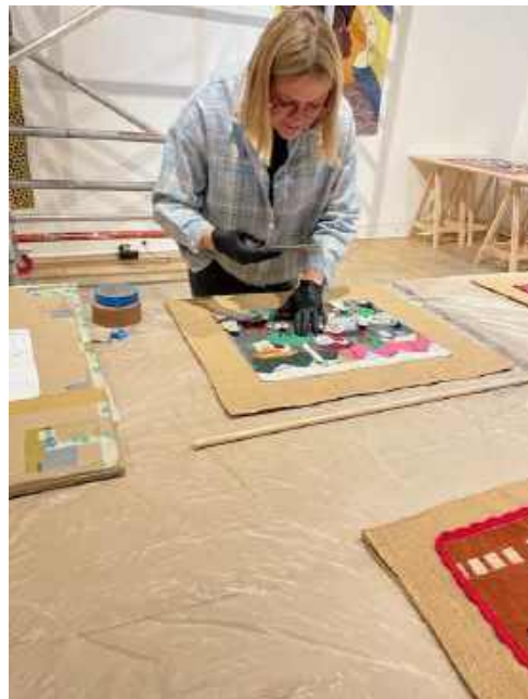
Condition Report checks.