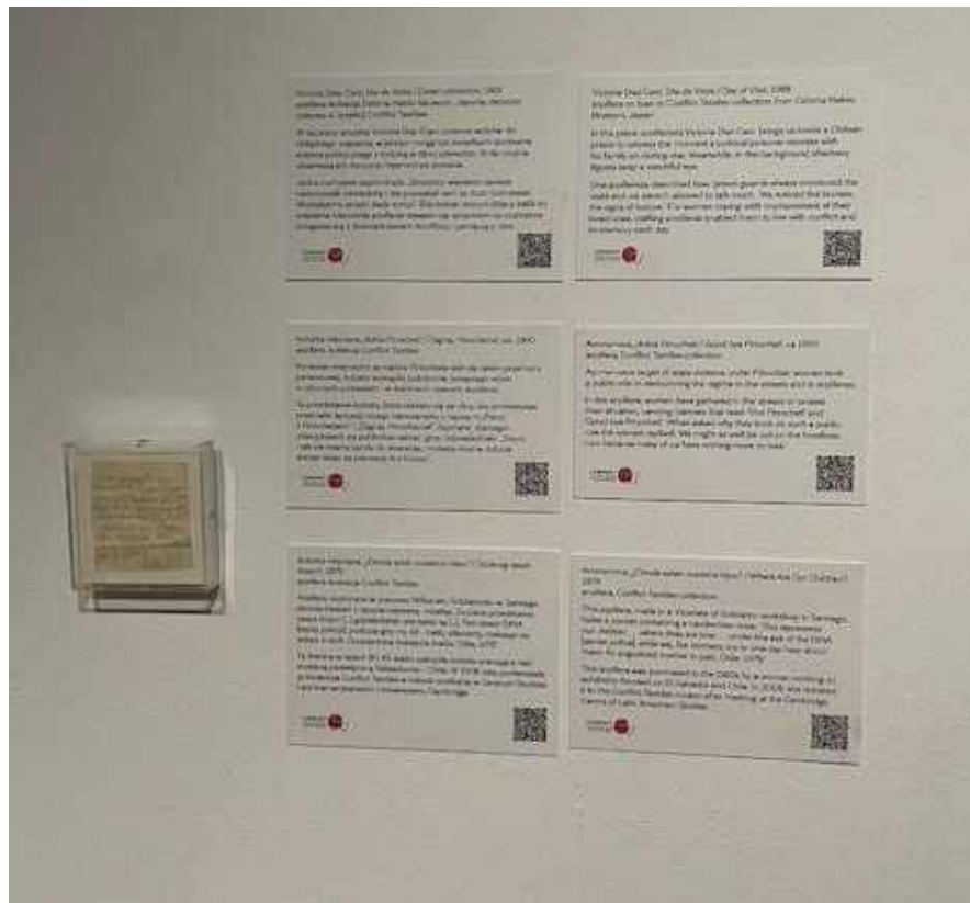
Arpillera labels and framed letter handwritten note that was found in a small pocket at the back of the arpillera ¿Dónde están nuestros hijos? / Where are our children?