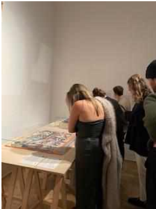
Visitors view the arpilleras at the opening