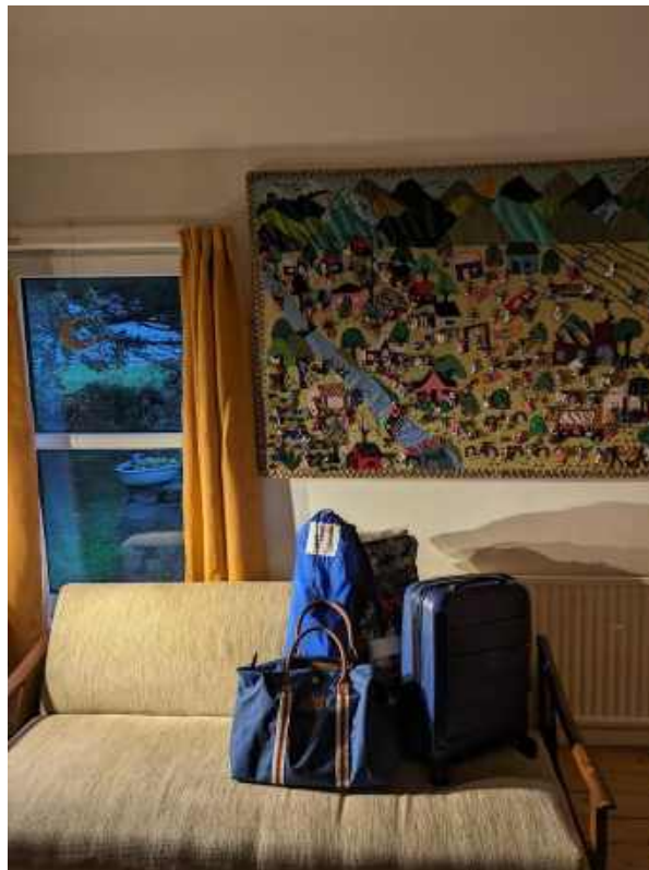
Arpilleras and luggage all ready for trip to Warsaw.