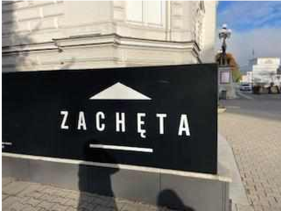
Arrival at Zacheta National Museum of Art