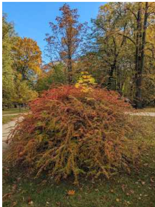
View of the parks around the Museum