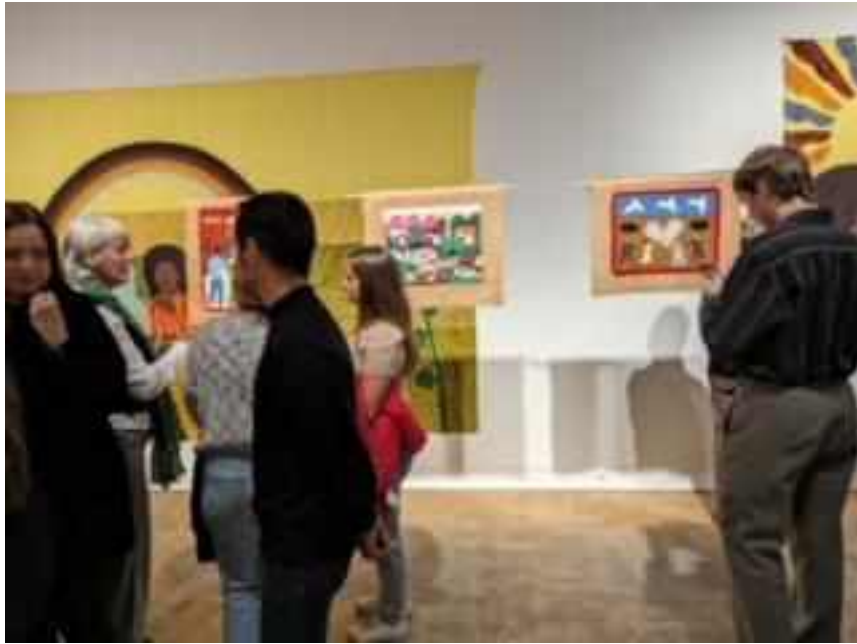
Visitors view the arpilleras at the opening.