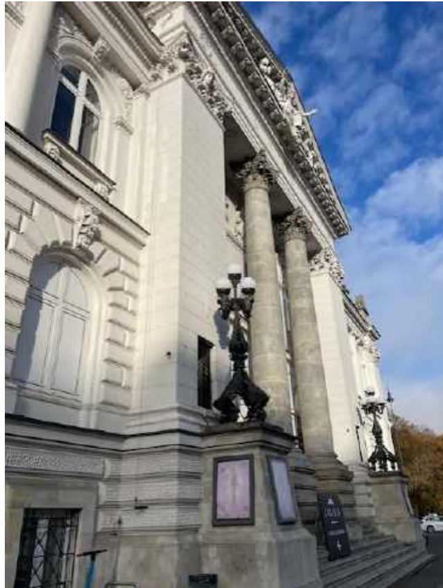
Zacheta Museum of Art, Warsaw