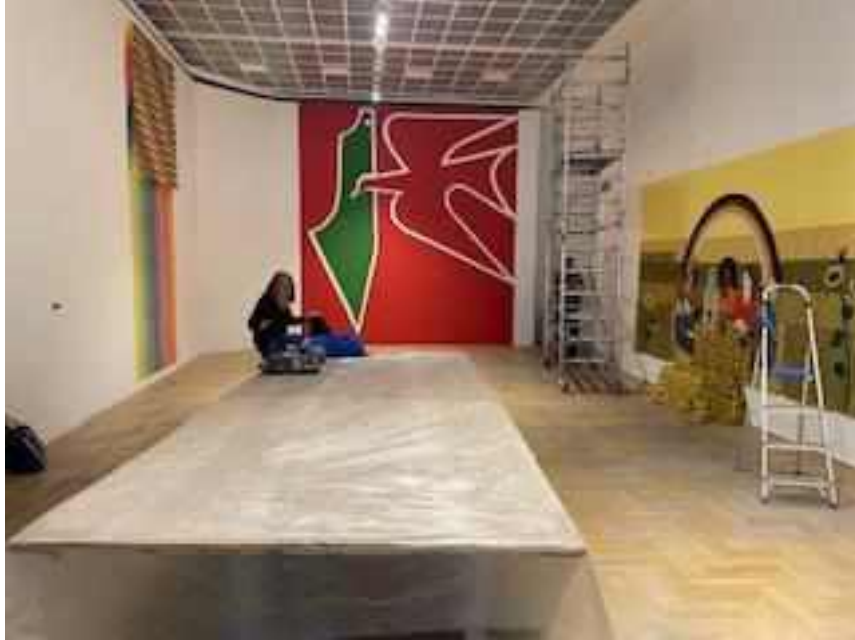
Gallery when we arrived