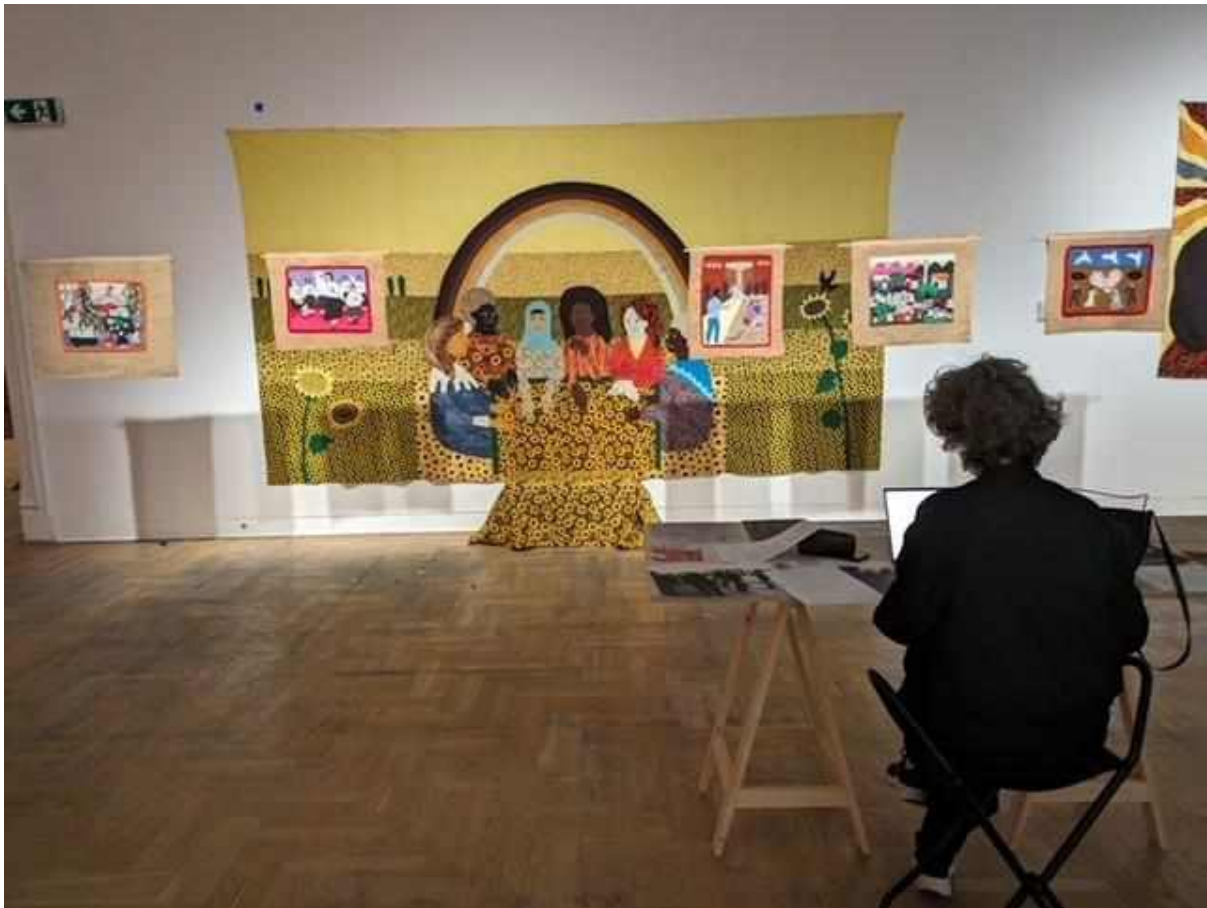
Arpilleras hanging from the ceiling, backdrop textile inspired by arpilleras created by Ukrainian artist Oksana Bruchovetksa