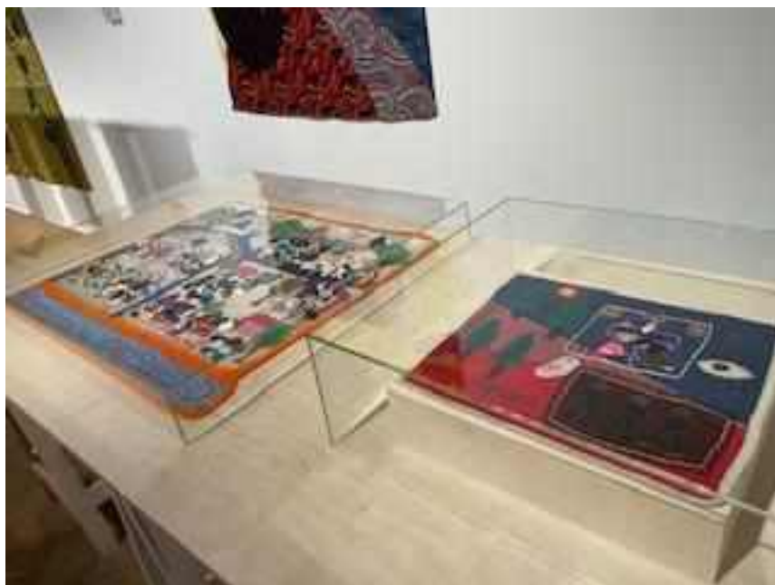
Al Servicio de la Vida / Servicing Life and Prisoners de Cuatro Alamos / Prisoners of Cuatro Alamos displayed under glass boxes.